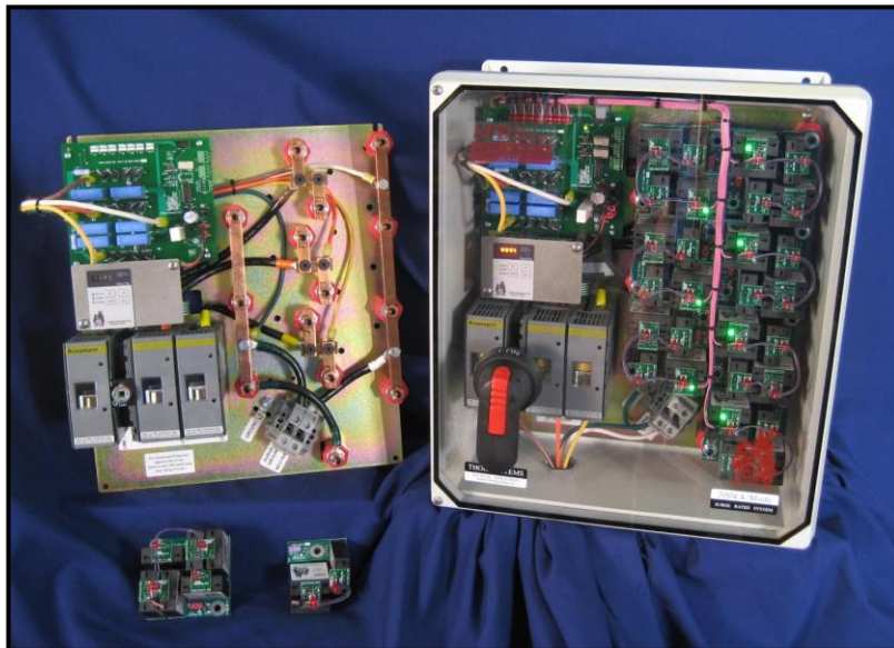
Complete Hybrid System

Finally, THOR SYSTEMS added the filter capacitors to provide protection for events that occur below the conduction point of the TpMOV/TVS diode array. This protection is referred to by many names from various suppression system manufacturers – sine wave tracking, noise attenuation, capacitive filtering, etc. – to effectively attenuate events initiated by energizing/de-energizing motors, transformers, capacitor banks and other reactive based equipment. Whatever name is used, the industry standard for filter attenuation is MIL STD 220A and THOR SYSTEMS offers filter capacitor networks with attenuation levels in excess of 50dB to address those occurrences.