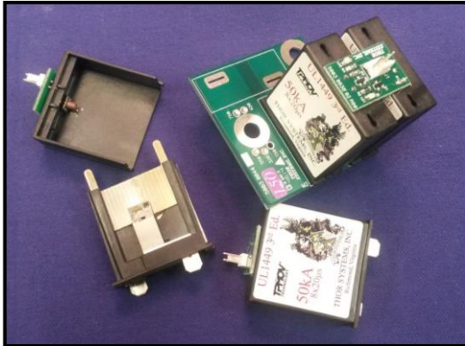
Thermally Protected MOV (TpMOV)

The foundation of THOR SYSTEMS' surge protection design is the Thermally Protected MOV (Metal Oxide Varistor).